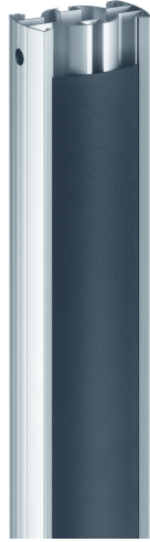
300 cm pole PUC 2530