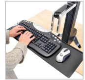
Large Keyboard Tray for WorkFit-S 97-653 (black)