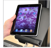
Tablet/Document Holder for WorkFit-S 97-558-200 (black) Includes lift handle