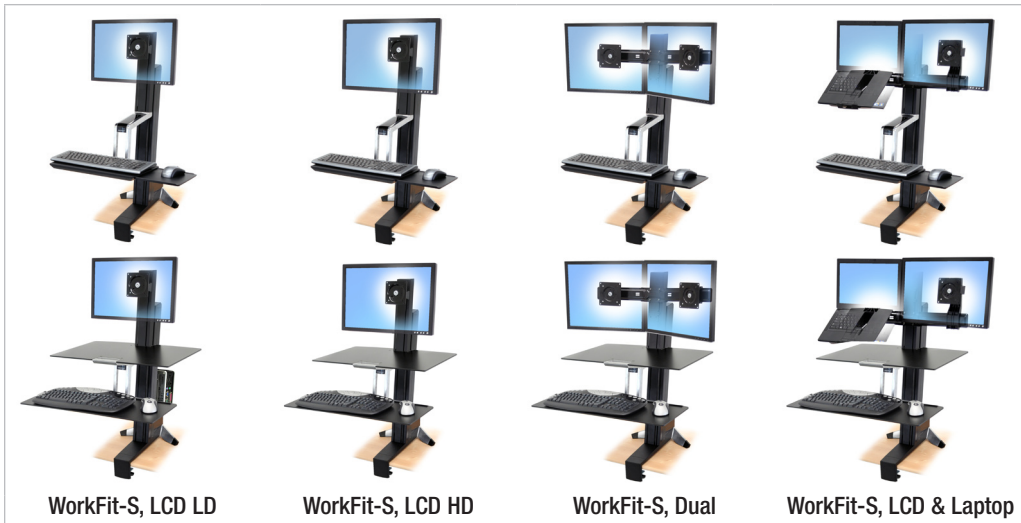
WorkFit-S, LCD LD