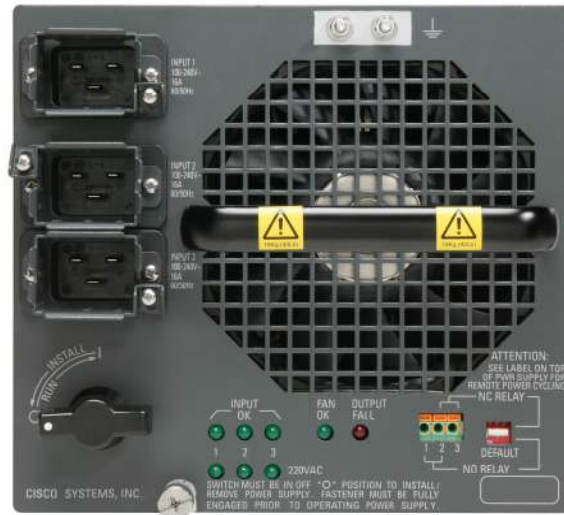
Figure 1. Cisco 8700W Enhanced AC Power Supply for Cisco Catalyst 6500 Series Switches

The 8700W enhanced AC power supply provides the ability to remotely power cycle or shut down Cisco Catalyst 6500 Series Switches for maintenance using Normally Open (NO) or Normally Closed (NC) built-in external relay contacts using a front-panel terminal block interface. The power supply relay contacts can be controlled through any appropriate third-party relay controller.