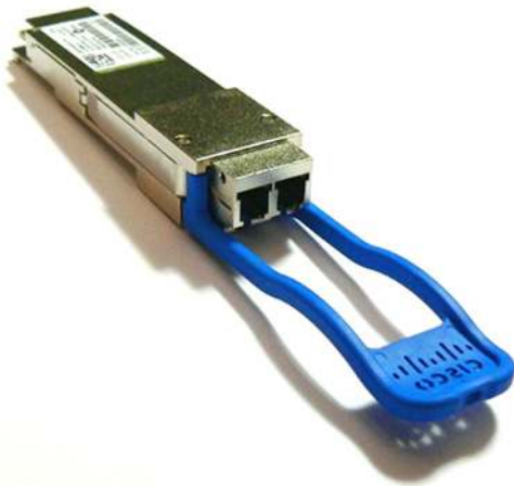
Figure 2. Cisco 40GBASE-LR4 QSFP+ Module

The Cisco 40GBASE-LR4 QSFP+ Module (Figure 2) supports link lengths of up to 10km over a standard pair of G.652 single-mode fiber with duplex LC connectors. The 40 Gigabit Ethernet signal is carried over four wavelengths. Multiplexing and demultiplexing of the four wavelengths are managed within the device.