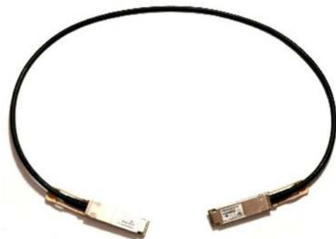
Figure 4. Cisco 40GBASE-CR4 QSFP+ Direct-Attach Copper Cables

Cisco QSFP+ to QSFP+ copper direct-attach 40GBASE-CR4 cables (Figure 4) are suitable for very short distances and offer a highly cost-effective way to establish a 40-Gigabit link between QSFP+ ports of Cisco switches within racks and across adjacent racks. Cisco currently offers passive cables in lengths of 1, 3 and 5 meters, and active cables in lengths of 7 and 10 meters.