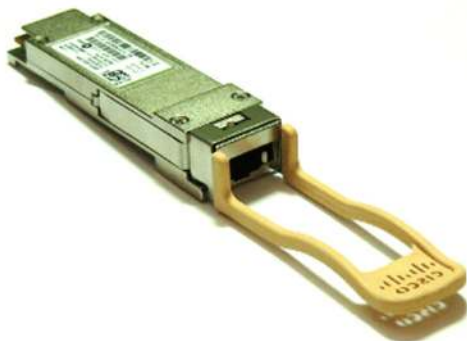
Figure 1. Cisco 40GBASE-SR4 QSFP+ Module

Figure 1 shows a 40GBASE-SR4 QSFP+ module.