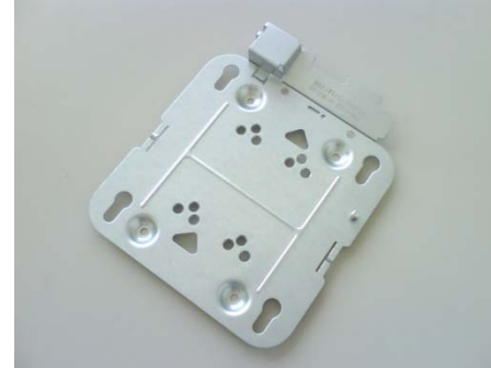
AIR-AP-BRACKET-1 AP Bracket: Low-Profile (Default bracket option)