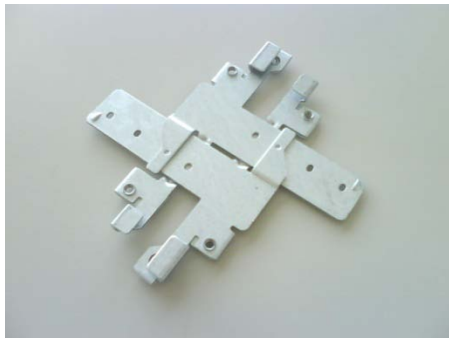
AIR-AP-T-RAIL-F Ceiling Grid Clip: Flush