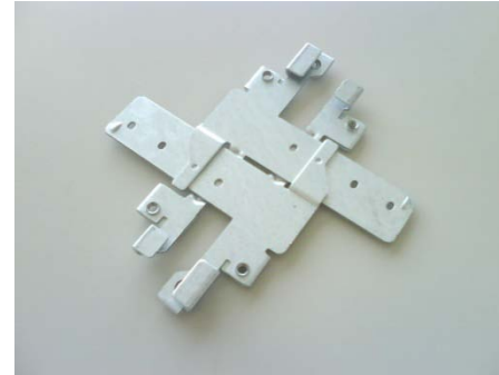
AIR-AP-T-RAIL-F Ceiling Grid Clip (Flush)

If your ceiling tiles hang below the ceiling grid, this clip provides the best fit between the AP and the ceiling.