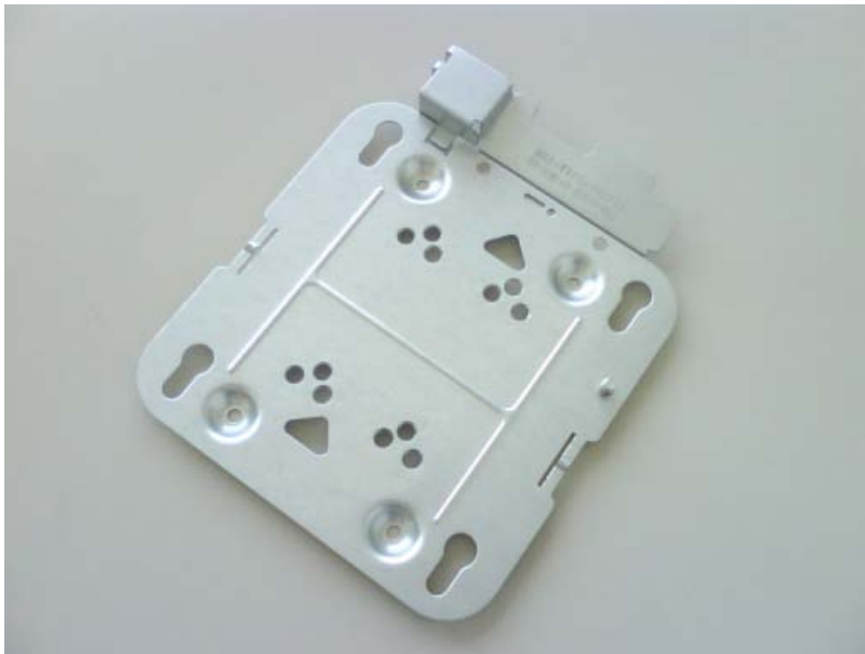
AIR-AP-BRACKET-1 AP Bracket: Low-Profile

This bracket minimizes the gap between the AP and the ceiling but does not accommodate network/electrical box or wall mounting.