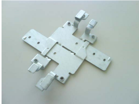
AIR-AP-T-RAIL-R Ceiling Grid Clip: Recessed (Default clip option)