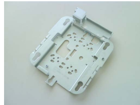
AIR-AP-BRACKET-2 AP Bracket: Universal