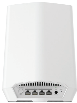
Orbi Pro WiFi 6 Satellite (SXS50)