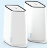
Orbi Pro SXK50 series