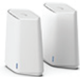
Orbi Pro SXK30 series