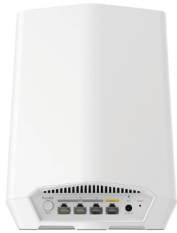
Orbi Pro WiFi 6 Router (SXR50)