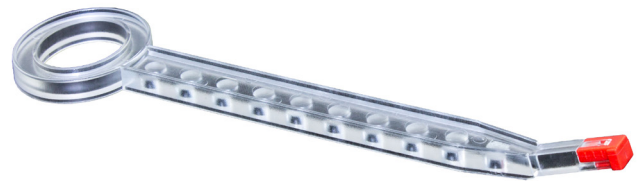
Boot Removal Key