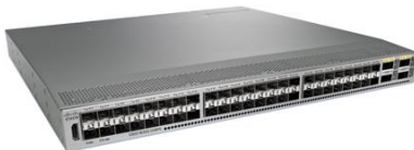
Figure 4. Cisco Nexus N2248PQ

The Cisco Nexus 2232PP 1 and 10 Gigabit Ethernet fabric extender (Figure 5) is an excellent platform for migration from 1 Gigabit Ethernet to 10 Gigabit Ethernet and unified fabric environments. It supports FCoE and DCB.