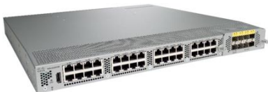
Figure 6. Cisco Nexus N2232TM-E

Cisco Nexus 2000 Series Fabric Extenders connect to a parent Cisco Nexus switch through their fabric links using CX1 copper cable, short-reach or long-reach optics, and the cost-effective Cisco Fabric Extender Transceivers. Fabric Extender Transceivers are optical transceivers that provide a highly cost-effective solution for connecting the fabric extender to its parent switch over OM3 or OM4 multimode fiber.