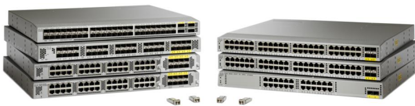
Figure 2. Cisco Nexus 2000 Series Fabric Extenders from Bottom Right to Top Left: Cisco Nexus 2224TP GE, 2248TP GE, 2248TP-E GE, 2232TM 10GE, 2232TM-E 10GE, 2232PP 10GE, and 2248PQ 10GE; Cost-Effective Fabric Extender Transceivers for Cisco Nexus 2000 Series and Cisco Nexus Parent Switch Interconnect Are in Front of the Fabric Extenders

The Cisco Nexus 2000 Series provides two types of ports: ports for end-host attachment (host interfaces) and uplink ports (fabric interfaces). Fabric interfaces, differentiated with a yellow color, are for connectivity to the upstream parent Cisco Nexus switch.