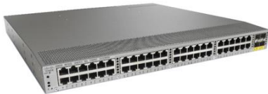
Figure 3. Cisco Nexus N2248TP-E

The Cisco Nexus 2248PQ 10 Gigabit Ethernet fabric extender (Figure 4) is the newest member of the Cisco Nexus fabric extenders. It supports high-density 10 Gigabit Ethernet environments and has 48 x 1 and 10 Gigabit Ethernet SFP+ host ports and 4 QSFP+ fabric ports (16 x 10 Gigabit Ethernet fabric ports). QSFP+ connectivity simplifies cabling while lowering power and solution cost. The Cisco Nexus 2248PQ 10GE Fabric Extender supports FCoE and a set of network technologies known collectively as Data Center Bridging (DCB) that increase the reliability, efficiency, and scalability of Ethernet networks. These features allow support for multiple traffic classes over a lossless Ethernet fabric, thus enabling consolidation of LAN, SAN, and cluster environments.