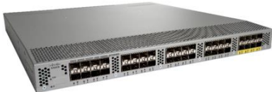
Figure 5. Cisco Nexus N2232PP

The Cisco Nexus 2232TM-E fabric extender (Figure 6) supports scalable 1/10GBASE-T environments, ease of migration from 1GBASE-T to 10GBASE-T, and effective reuse of existing structured cabling. It comes with an uplink module that supports eight 10 Gigabit Ethernet fabric interfaces. It is a superset of the Cisco Nexus 2232TM with the latest generation of 10GBASE-T PHY, enabling lower power and improved bit error rate (BER). The Cisco Nexus 2232TM-E supports DCB and LAN and SAN consolidation. FCoE support distances of up to 30 meters with Category 6a and 7 cables from the adapter to the fabric extender.