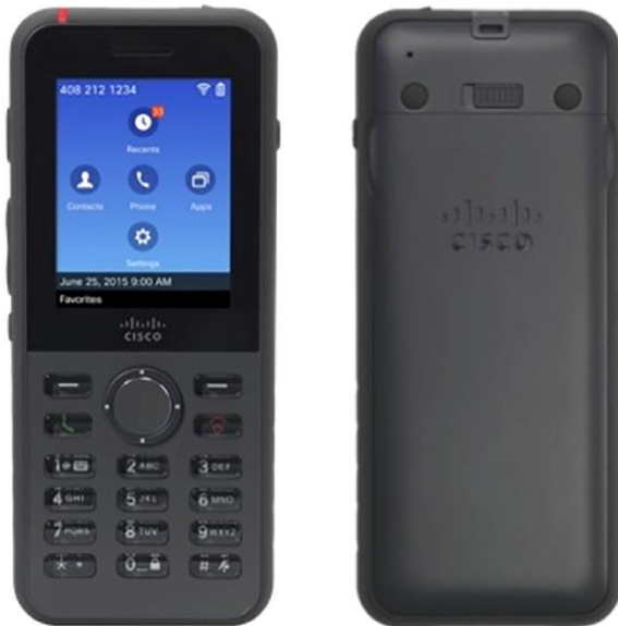
Figure 1. Cisco Wireless IP Phone 8821