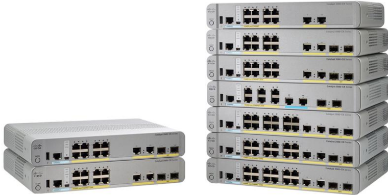
Figure 1. Cisco Catalyst 3560-CX and 2960-CX Compact Switch Family

Figure 1 shows the Cisco Catalyst 3560-CX and 2960-CX switch family.