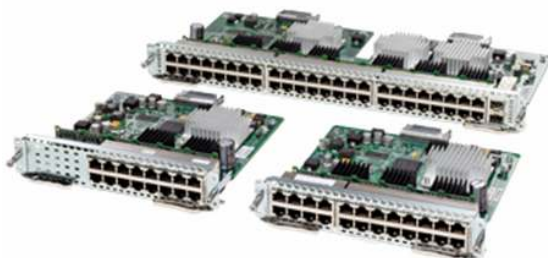
Figure 1. Cisco Enhanced EtherSwitch Service Modules

The Cisco Enhanced EtherSwitch Service Modules (Figure 1) greatly expands the router's capabilities by integrating industry-leading Layer 2 and Layer 3 switching with feature sets identical to those found in the Cisco Catalyst® 3560-E and Catalyst 2960 Series Switches. The new Cisco Enhanced EtherSwitch Service Modules are the first modules to take advantage of the increased capabilities on the Cisco 3900 and 2900 Series Integrated Services Routers. Additionally, these service modules enable Cisco's industry-leading power initiatives, Cisco EnergyWise®, Cisco Enhanced Power over Ethernet (ePoE), and per-port PoE power monitoring—all of which enhance the ability of the branch office to scale to next-generation requirements and still meet important initiatives for IT teams to operate a power efficient network. Furthermore, the Cisco Enhanced EtherSwitch Service Modules not only perform local line-rate switching and routing but also support direct service module-to-service module communication through the Integrated Services Router Generation 2 multigigabit fabric (MGF) which separates LAN traffic from WAN resources.