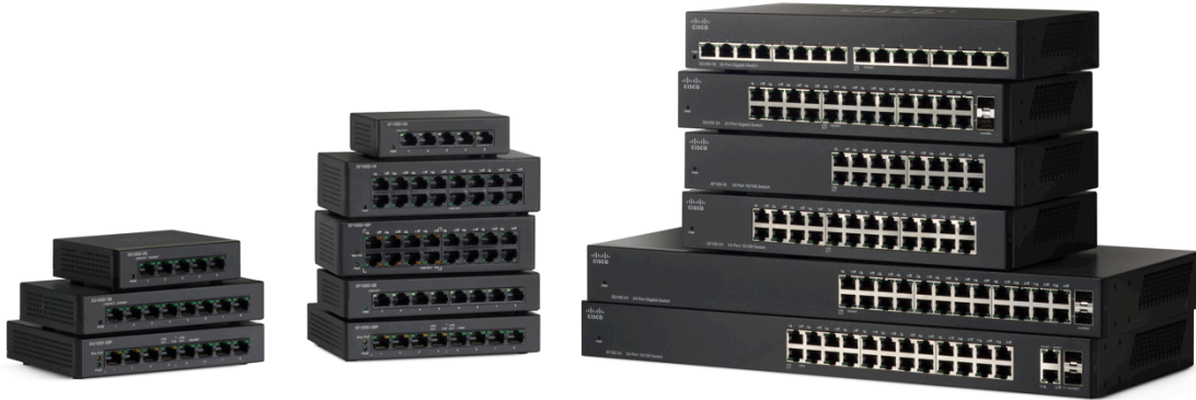
Figure 1. Cisco 110 Series Unmanaged Switches