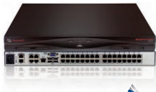
Avocent MergePoint Unity™ 32-port switch